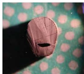
Figure 17: Cross-section of the O-ring of FKM material, which experienced decompression structural damage.

This phenomenon occurs almost exclusively in sliding rings made of carbon graphite materials. It appears by the formation of characteristic spot damage to the sliding surface in the form of bulges surrounded by cracks (figure 18). These cracks extend to a small depth under the bulge surface, which becomes a “blister” detached off the ring. With time, chipping may occur in this area. There are currently several hypotheses about this phenomenon. Some of them say that it depends on several factors. The first of them is the type and viscosity of the sealant. The higher viscosity, the greater the risk of blistering, which most often happens when sealing viscous oil liquids. Another factor is the contact pressure on the sealing ring sliding surface. Both of these factors are highly important because they cause the formation of adhesion forces between the ring faces. The moment of start-up is critical when the greatest shear stress is exerted on the sliding surface area. This causes local exceeding of their admissible values for a given material, which results in the formation of characteristic subsurface cracks. The next factor that may favour the formation of defects is the local increase in temperature causing an increase in the volume