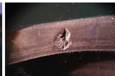
Figure 18: The sliding surface of the ring of carbon graphite material on which the blistering phenomenon occurred (right, enlarged view of the recess after chipping off the blister).