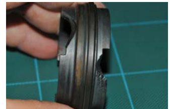
Figure 10: Pair of mating sealing rings damaged due to excessive adhesion forces on the working surfaces.

In this situation, using the seal with two rings of hard material results in the fact that crystallisation of the particles, present in the lubricating film, causes enlargement of the gap between the sealing surfaces, thus leading to the increased leakage. It is another example (as with viscous liquids) when the use of a double seal with barrier liquid protects against this type of failure.