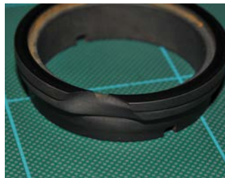
Figure 14: Local erosion of the stationary ring caused by a stream of liquid in recirculation.