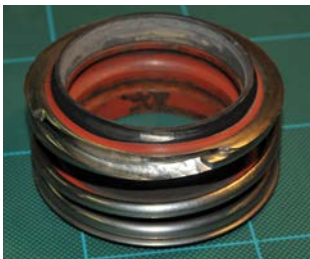
Figure 13: Seal rotational unit of A1 type prod damaged by erosion.

The mechanical erosion destroys not only the seal, but also the machine in which this phenomenon occurs. The presence of solid particles is predominantly undesirable, and to limit the erosion, these need to be separated. Locally occurring erosion damage of the stationary rings (figure 14) operating in recirculating systems may be associated with excessive liquid velocity in the recirculation circuit. In this case, it is recommended to change the stationary ring material for a material that is more erosion resistant or to use an orifice in the recirculation circuit. This orifice mounted close to the flush liquid inlet causes reduction in the flow velocity at the outlet where the seal is placed.