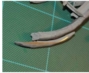
Figure 15: Corroded ring of cobalt bonded tungsten carbide as a result of contact with acidic medium.

The future user should also give detailed information on all substances periodically occurring during the production process. The food industry may be used as an example here, in which the media occurring in the basic processing do not pose any hazard to most elastomers, while in the cleaning process of the CIP installation (Clean in Place), alkaline and acidic agents are used (e.g. nitric acid solution), which narrow the range of materials that can be used in the seal. In case of chemical damage to any of the seal components, it is necessary to change its materials or even design.