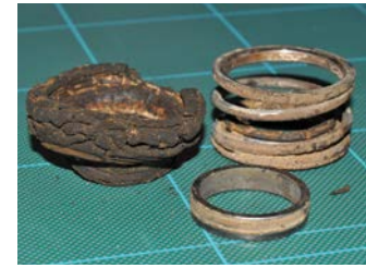
Figure 16: Elastomer bellows of FKM material degraded chemically.